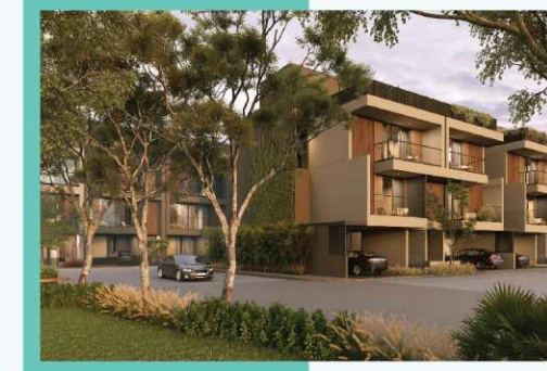
ARVIND FOREST TRAILS Luxury villas