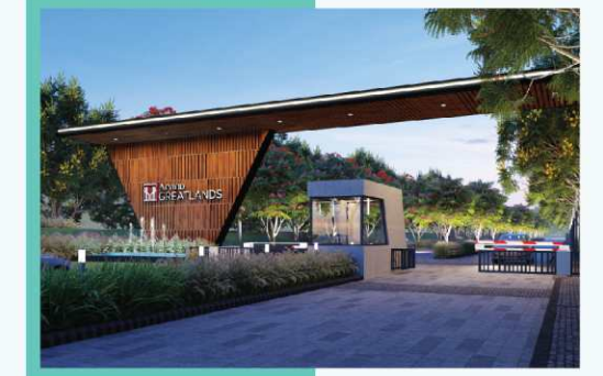
ARVIND GREATLANDS Luxury villa plots