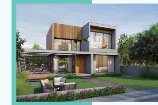
ARVIND ORCHARDS Premium villa plots