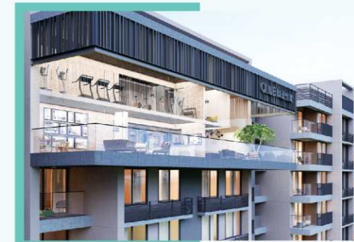
ARVIND BEL AIR Luxurious residences with unlimited lifestyle