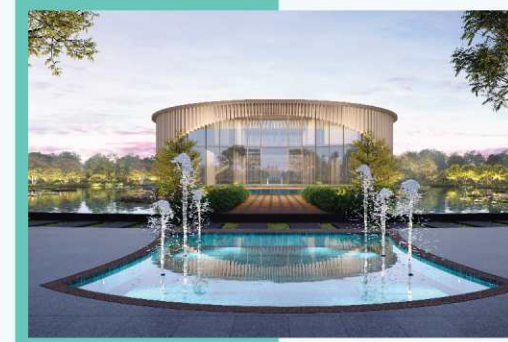
ARVIND RHYTHM OF LIFE Premium plots