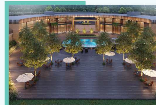
ARVIND UPLANDS 2.0 Premium Golf Villas & Plots