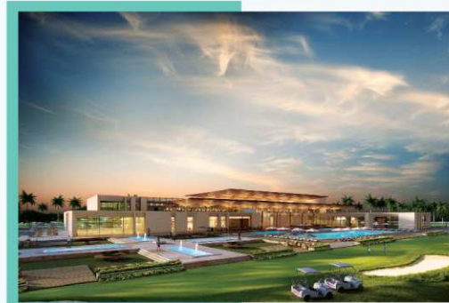
ARVIND HIGHGROVE Premium golf villas and plots