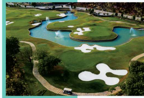
ARVIND UPLANDS Ultra-luxury golf villas