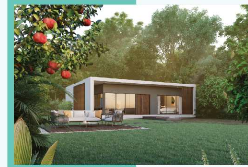
ARVIND FRUITS OF LIFE Premium weekend villa plots