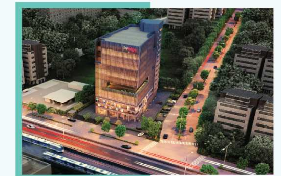
ARVIND THE EDGE Modern retail, commercial and office spaces