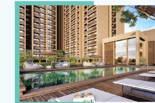
ARVIND OASIS Premium residences surrounded by soothing waterbodies