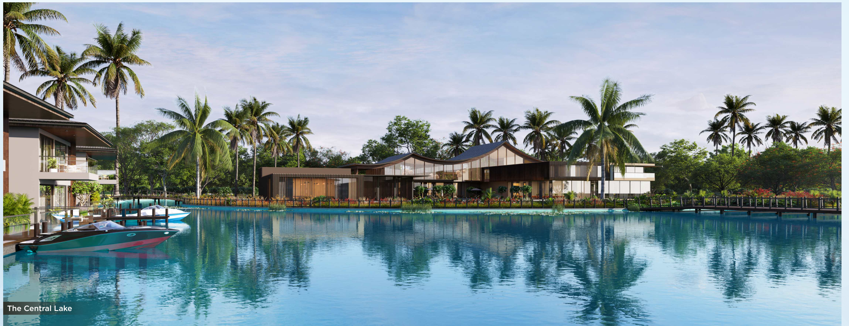
The Central Lake

At the core of this extraordinary estate lies a breathtaking 30-acre central lake and surrounding spaces serving as the serene heart of the community and setting the stage for an unparalleled living experience. The central lake is an iconic feature, artfully designed to evoke a sense of peace and harmony with its tranquil waters and lush surroundings. Nestled within this vast expanse of water are three distinct islands, each meticulously crafted to serve a unique purpose. Beyond these three islands, Arvind Aqua City offers an array of other luxurious amenities that blend seamlessly with the natural environment. Luxurious water villas line the shores, offering residents a unique living experience reminiscent of tropical paradises, while 11 temples provide spaces for spiritual reflection and community gatherings.